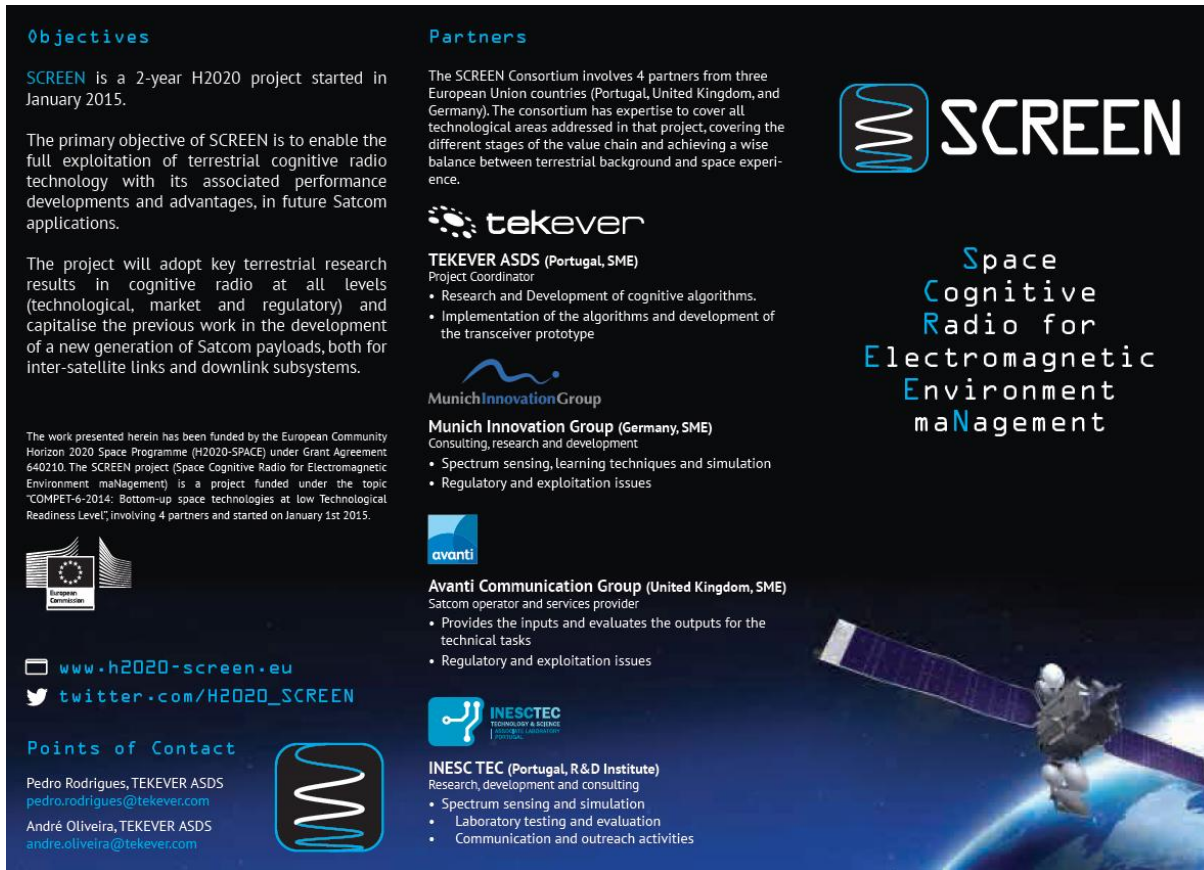
Figure 1 – Screenshot of the brochure layout (front)

The SCREEN brochure was developed using a three column (triptych) template. Figure 1 and Figure 2 show the brochure front and back sides respectively. The design approach followed consists in a background image from a SatCom satellite (courtesy of AVANTI), in a dark blue colour, and white text. The layout consists in 3 columns.